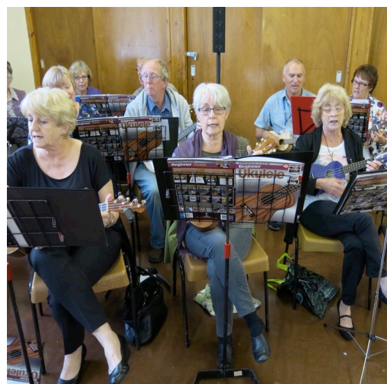
The Ukulele group played to an audience for the first time this month. They concluded their performance with the Eastwood U3A Anthem.